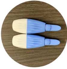
BD Microtainer® Contact-Activated Lancer