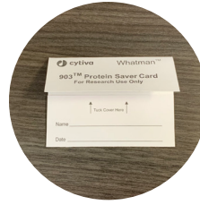
Blood Spot Card